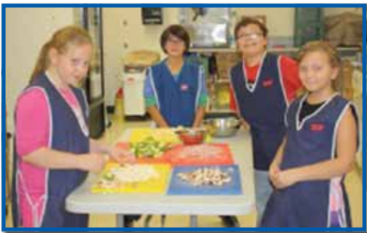
V.M.P.C.S. Grade 4 Students

In partnership with the Co-operative Health Centre, Vincent Massey Community Public School offers a Kids in the Kitchen after-school program. Students learn kitchen safety, food safety, and hands-on food preparation. This interactive class also includes educational information about the importance of