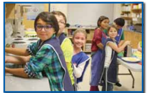
V.M.P.C.S. Grade 4 Students

healthy eating and being physically active. Each week students eat/take home the food they prepare. At the end of the six week program, the students take home a recipe book and nutritional information to share with the whole family. We are very fortunate to be able to offer this program 3-4 times a year for our students from Grade 3 to 6.