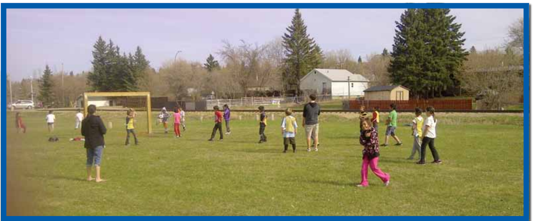
Ranch Ehrlo Society helping to provide a soccer program for Queen Mary Community Public School students.