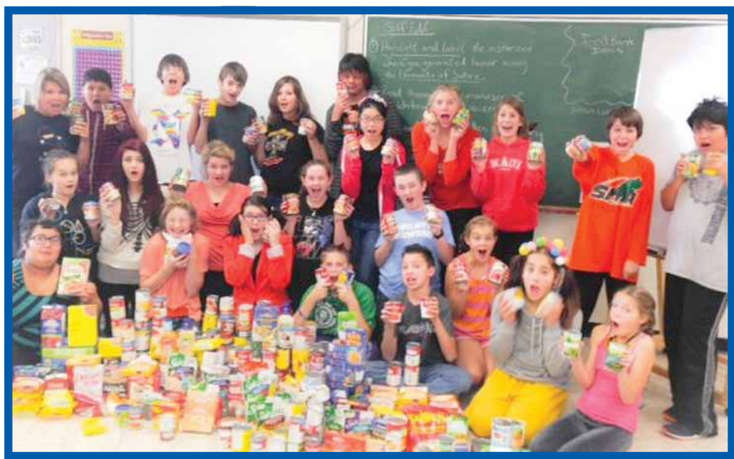
Members of the SLC at Arthur Pechey organized the We Scare Hunger campaign. The school collected over 700 items of food for their local food bank.

This fall, thousands of young people took part in Free The Children's - We Scare Hunger campaign, collecting non-perishable food items for local food banks instead of candy. One of two local campaigns Free The Children runs on an annual basis, We Scare Hunger gives youth a unique opportunity to help end hunger in their own communities by making a tangible contribution to an important local cause. This year alone over 2,175 schools participated in this campaign, 112 of these schools were from Saskatchewan. Seven schools from Saskatchewan Rivers Public participated: Arthur Pechey Public School, Carlton Comprehensive Public High School, Christopher Lake Public School, Red Wing Public School, Riverside Community Public School, T.D. Michel Elementary Public School, and W.J. Berezowsky Public School.